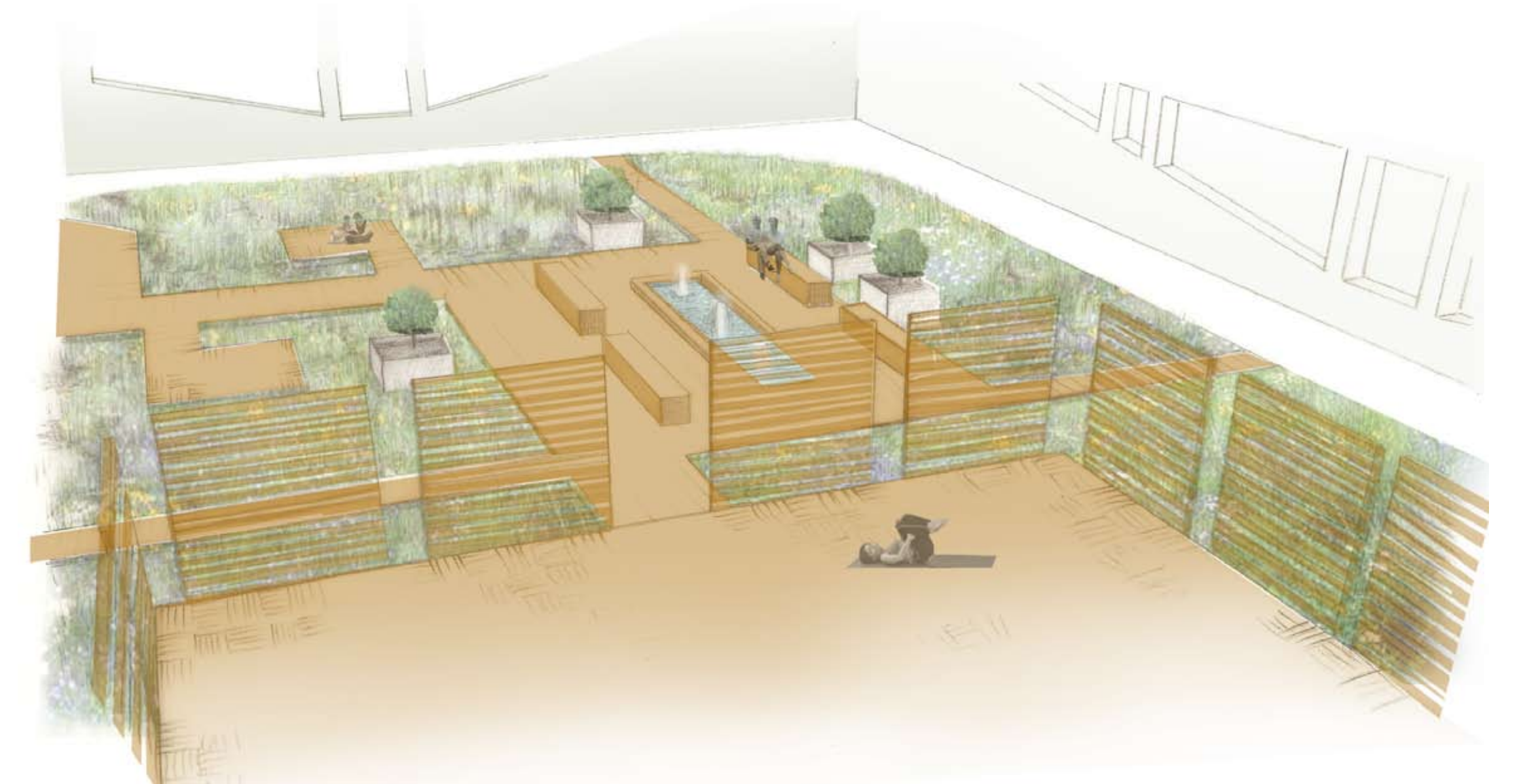
Outdoor studio and deck