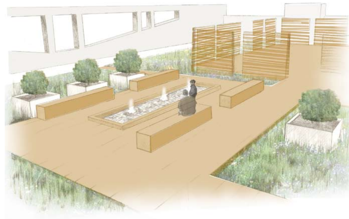
Deck with water feature and seating