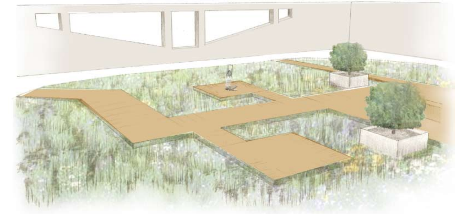
Main pathway and platforms